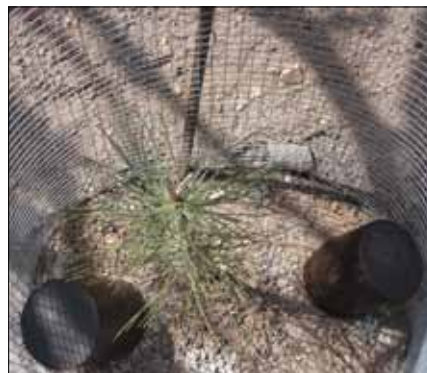
Arrowcreek fire restoration: Washoe County, NV