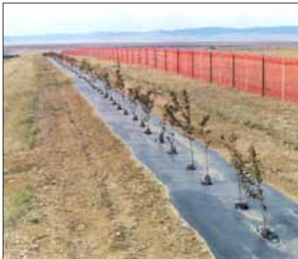
Snow Fence: WY-DOT

Immediately following planting, each plant shall be thoroughly watered such that soil around roots will be saturated from bottom of hole to soil surface.