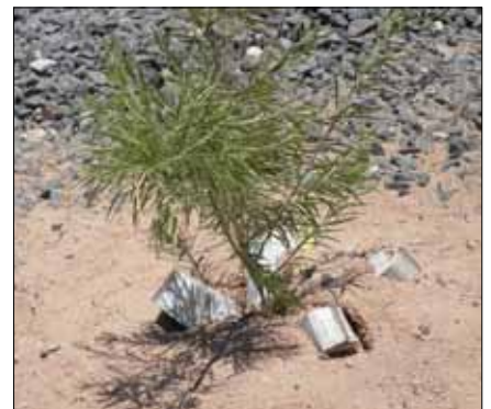
Spook Hill Flood Retarding Structure: FCDMC