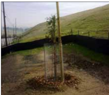
Caltrans - Vasco Rd: Northern CA