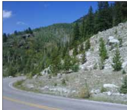
Road-cut revegetation: Independence Pass, CO