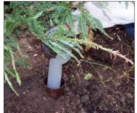
Redwood revegetation: Northern, CA